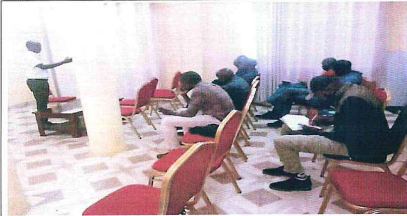
Session at the boardroom